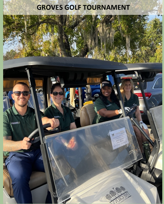
GROVES GOLF TOURNAMENT